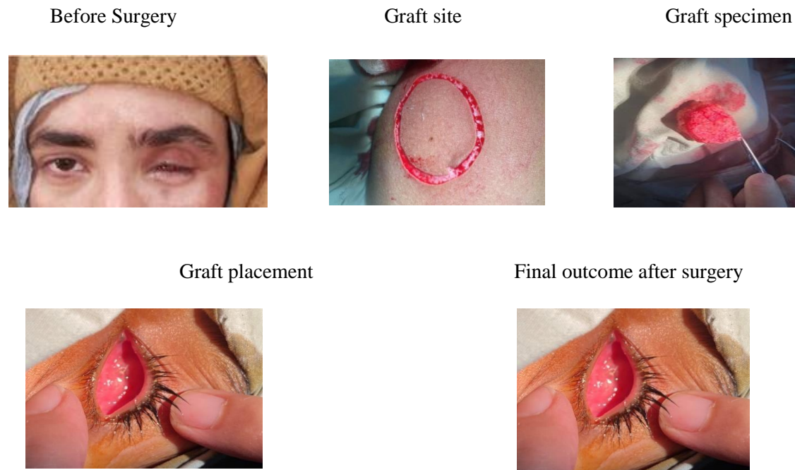
Figure-2: Anophthalmic orbit reconstruction with dermofat graft